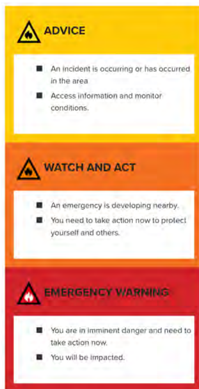
Illustration: Bushfire Warning Levels

and EMERGENCY WARNING . These change to reflect the increasing risk to life and the decreasing amount of time you have until the fire arrives.